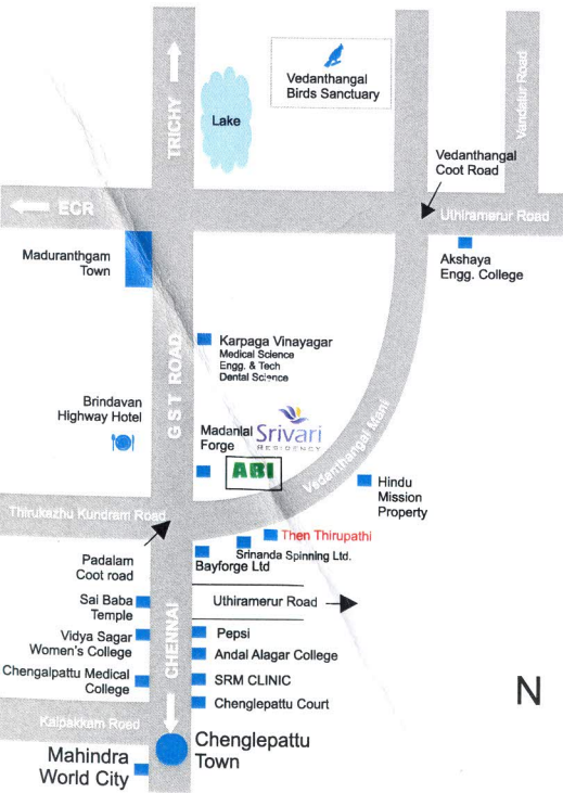
TOPO PLAN FOR SRIVARI RESIDENCY

Approved lay-out of house sites in S.No.:50/1, of Vedavakkam Madura Malai Vaiyavoor Village, Maduranthagam Taluk, Kancheepuram District.